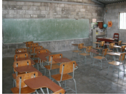
Santa Rita School

During the past few months, The Salvador Foundation in conjunction with Great Commission Latin America (GCLA) and the local community installed a new, purified water system in Santa Rita. Labor needed to install the new water system was provided by residents of Santa Rita, while financial support to cover materials and engineering were provided by King of Glory Church (Austin, TX), Salvador Imaging, Inc. and other private donors. The outpouring of support for this effort was so overwhelming that we received nearly twice the budget needed to complete the purified water system. As a result, a secondary project was initiated to install lighting and ventilation fans in Santa Rita's one-room school house shown to the right. In addition to the lights and fans, the school will be painted on the inside with bright colors more suitable for an elementary school environment.