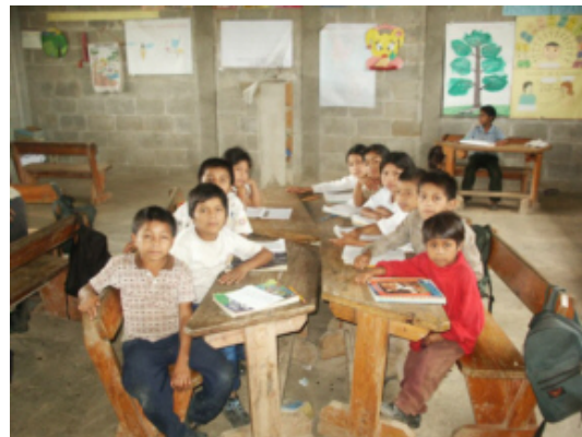
Santa Rita Students

The Salvador Foundation is currently supporting efforts in the US and Latin America. If you would like further information on this or any other activities, please contact: