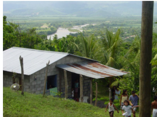
Santa Rita with River in Background

Santa Rita is a small village of about 200 people in a mountainous region of northwestern Honduras. The economy and infrastructure of Honduras was destroyed by Hurricane Mitch along with the rest of Honduras, and an aging water supply for the village recently ran dry.