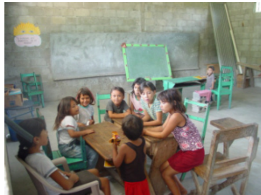
Santa Rita Students